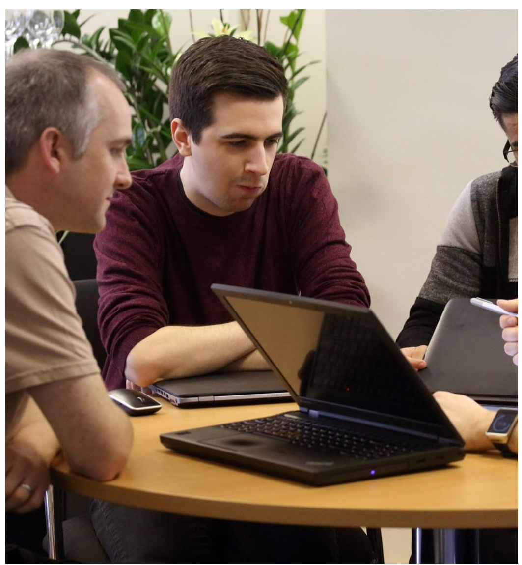
Thinking caps on!

To bring the plans to fruition, the team used a technology called Xamarin forms. It would them to write the app and give the end-user a native experience – looking and feeling as if the app was written for specific devices, regardless of whether you were viewing it on iOS, android or a Windows phone or desktop!